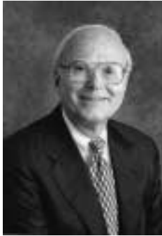
RICHARD A. CLARKE