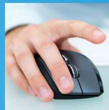
Image Retrieval provides direct access to shipment information. Users can retrieve electronic images of Proof of Delivery, BOL and other shipping documents directly from Con-way Freight.

Improve your employees' productivity. You can also use XML to embed any of our services directly into your company's intranet, allowing employees to track a shipment or get a rate quote without needing to get on the Internet or our website.