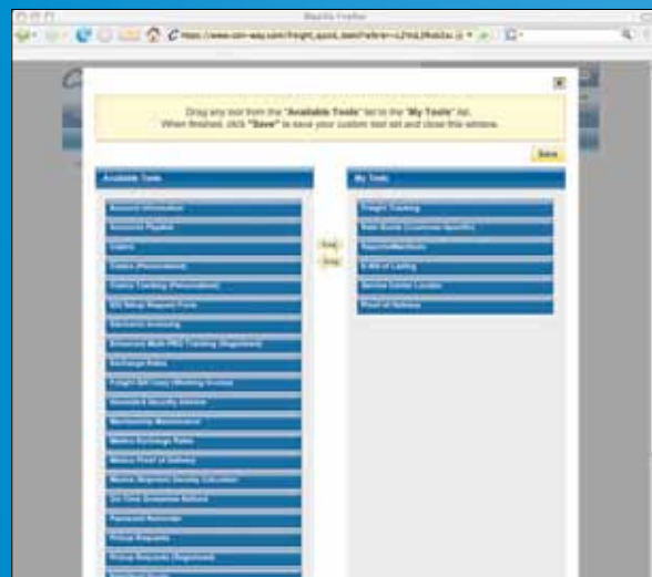
Customize My Tools to select the web tools that match your needs.

As you get ready to ship, our web tools help you easily get the information you need to make shipping faster and more efficient. You can request a rate quote, check transit times, schedule shipment pickups, check currency rates, and find the service center nearest you.