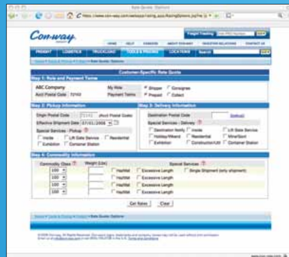
Our web tools make getting rate quotes fast and easy. In addition to generating a rate quote for your next shipment, you can use our handy shipment calculators and create a pickup request or an electronic bill of lading (eBOL).