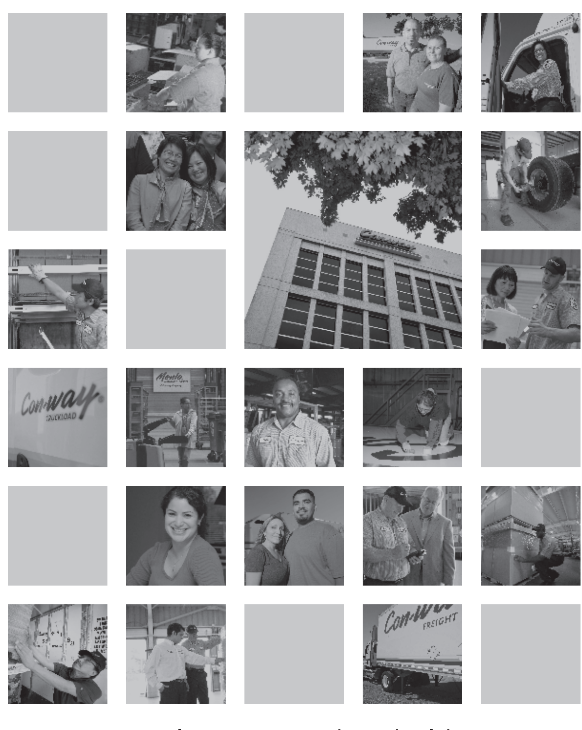
2010 Annual Report to Shareholders